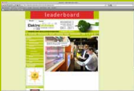
Leaderboard on the exhibition website