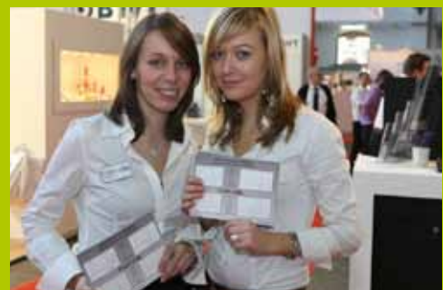
Handing out flyers