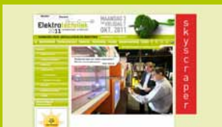
Seen by 75,000 visitors