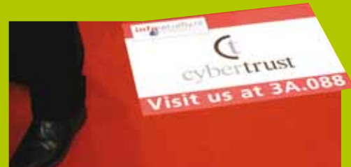
Logo on floor stickers

*Attention! All prices are excluding 19% VAT and production costs.