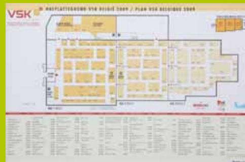
Logo on exhibition maps