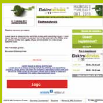
Logo in visitor marketing e-mail